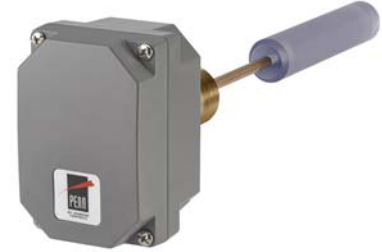
F263 Liquid Level Float Switch